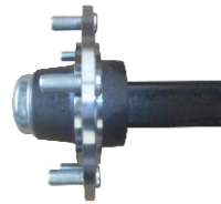
Shaft wheer axle tons